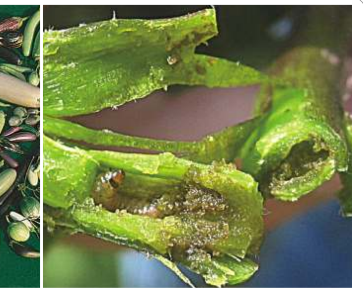
Brinjal shoot damaged by BSFB larva

membranes resulting in perforations of the membrane and cell lysis leading to the death of the larvae. Human beings, other mammals and non-target organisms including beneficial insects do not contain receptors to Bt proteins and hence are not susceptible to Bt